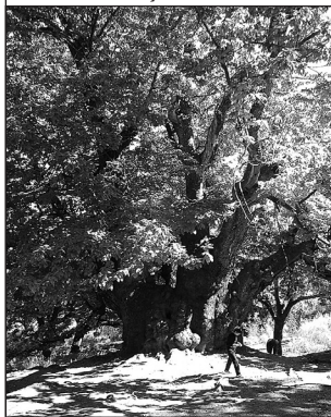
Three-hundred-year-old Castaña (Chestnut) Tree