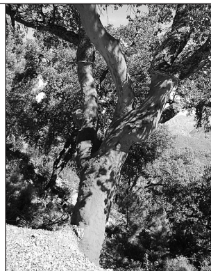
Freshly harvested Cork Oak Tree

We finally wound our way out of the mountains to reach the coastal town of Marbella from where we returned to Ronda in the mid-afternoon. While we learned a lot from Cuco during the day, he was also very interested in Canopy and California robles (oaks), and was eager to check out the Canopy website! ■