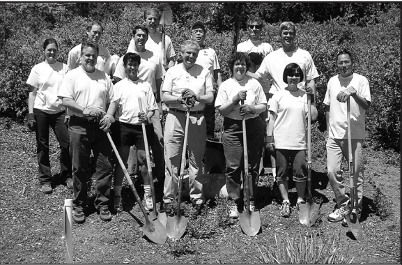
Canopy teamed up with Agilent to plant ten new trees at their Deer Creek site during an Earth Day employee workday.

OVER THE PAST COUPLE OF MONTHS, Canopy has been busy teaming up with local organizations in a variety of programs all aimed at fostering a better understanding our urban forest and taking an active part in its care. Canopy helped Ohlone School write and win a California Department of Forestry planting grant. This grant allowed the school’s kids, with the help of their teachers and parents, to plant 30 trees in March around the school’s play areas. To maximize shade, color and beauty, increase plant diversity, and provide varied educational opportunities, the project leaders decided to plant a combination of native redwoods, valley oaks, and black walnuts. Non-native Chinese pistache, tulip tree, ginkgo, and red maples rounded out the selection. Also in partnership with Ohlone School, Canopy