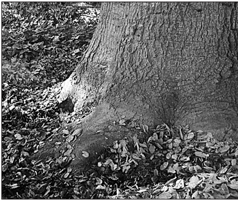
Below: The root flare of a coast live oak after it has been excavated from surrounding dirt.

Part of protecting trees from fungus includes removing ivy, lawn and other competing plants from the area around