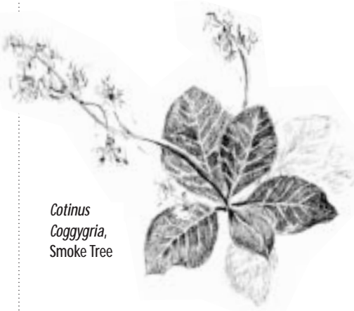
Cotinus Coggygria, Smoke Tree

Smoke Tree, most often seen as a shrub, can be trained into tree form. The dramatic puffs of “smoke” come from large, loose clusters of fading flowers that remain on the tree for weeks. Incense Cedar is considered a slow-growing tree which may grow two feet per year once established. Warm weather brings out its distinctive fragrance. Michelia doltsopa , blooms from January through March with soft white magnolia-like flowers that are very fragrant. A mature tree can be seen at Gamble Garden Center in front of the carriage house. Golden Chain Tree, planted throughout Europe, is known as Golden Rain in Germany. Spring blossoms resemble yellow, sweet pea-shaped flowers that hang in clusters like wisteria. ■