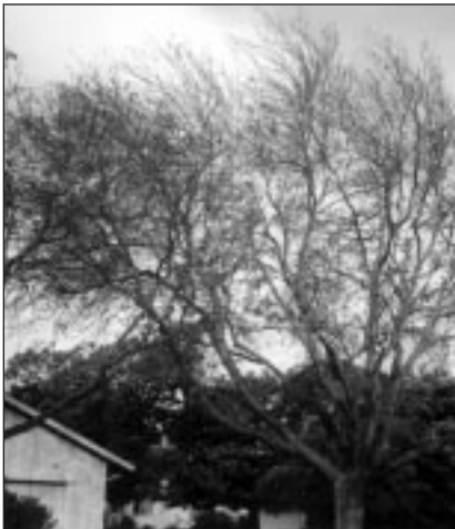
This street tree on Greer is one of hundreds throughout the city whose leaf production has been inhibited by anthracnose.

The culprit is anthracnose, a fungal disease which causes the leaves to turn brown in splotches, crinkle and fall off. This problem is common during a wet spring when lots of rain hits the new foilage, distributing spores which have over-wintered on infected twigs of the tree. Fortunately, anthracnose will not seriously harm a tree unless the new growth is repeatedly attacked,