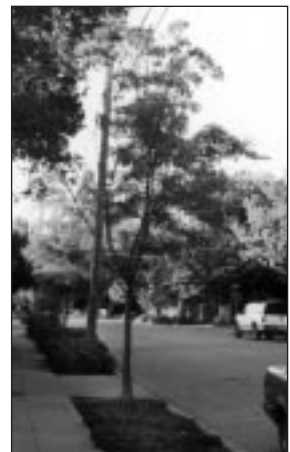
These three street trees planted at the same time show what watering and care can do—and doesn't do!