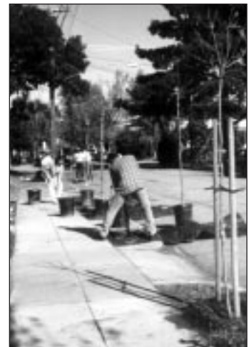
High Street planters dig the last hole for a row of sapling trees.