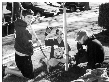
Boy Scout troop 76 helped plant new cherry trees in Bowden Park.

Seeds for the trees, taken from Palo Alto's eponymous stalwart—El Palo Alto, had orbited the earth aboard the Space Shuttle Challenger in its STS-51F mission from July 29 to August 6, 1985.