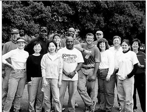
Volunteers from Roche Palo Alto joined Canopy and the City of Palo Alto to clear ivy from oaks in Pardee Park.

Whether you join our survey crew or not, remember that the hot days of summer are upon us— SO WATER TREES NOW! ■