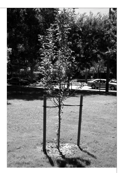
Example of proper staking—note loose ties and stakes trimmed to below lowest branches