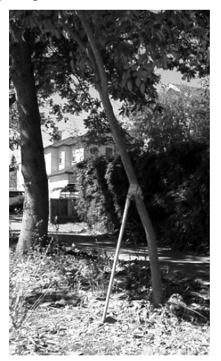
"Duct tape is like 'The Force.' It has a 'dark side' and a 'light side' and together they hold together the universe." —anon