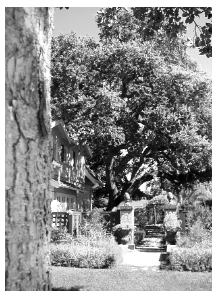
Two views of a comforting valley oak which graces an interior garden on Melville.