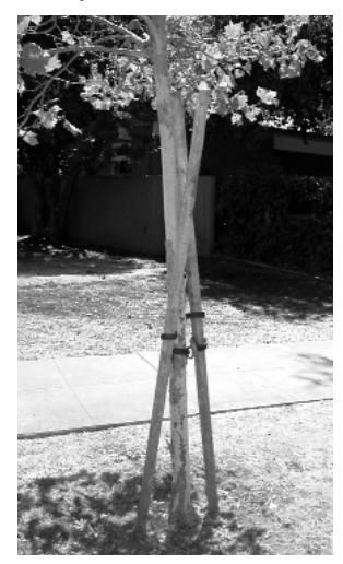
Three years after the planting these stakes are no longer helping this tree. They have come loose from their setting and are rubbing against the tree. The tree is obviously able to stand on its own.