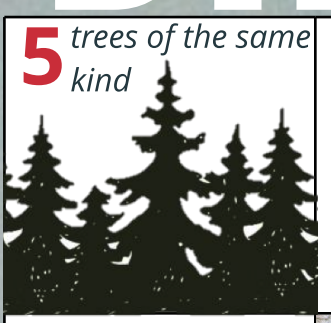
A TREE THAT IS

Remember to go outside with the permission of an adult, and stay 6 feet away from others. But you can get as close to the trees as you'd like!