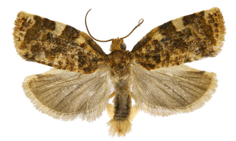
California Oak Moth Phryganidia californica