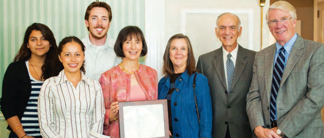
Canopy receives The Stanford Community Partnership Award